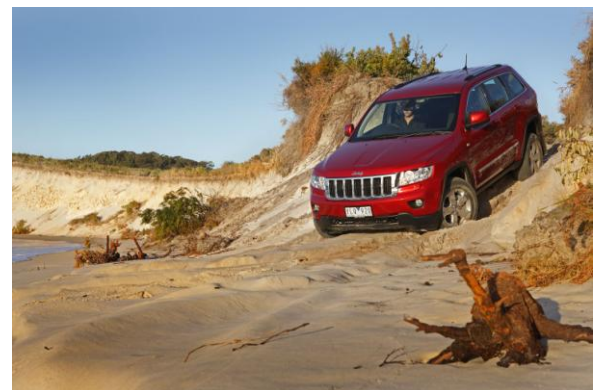
JEEP CHEROKEE TACKLING THE MORETON SAND TRACK